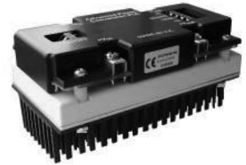
Powerstax ZTAF Full brick Terminal Adaptor c/w mounting Kits and Heatsink

Designed for the 500W, 350W and 200W version full brick modules, the terminal adaptor is also available to suit the popular triple out-put module DC-DC Converter.