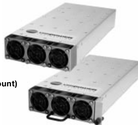
PCM Series (Chassis Mount)

Includes Isolated 5V, ¼ A Standby Output Hot-Swap or Chassis Mount Versions 12, 24 or 48 VDC Outputs Integral LED Status Indicators I2C Serial Data Bus Option Up to 10 Watts/Cubic Inch Power Density Power Factor Corrected Low Profile: 1.6 Inches High Single Hot-Swappable Connector Staged Pin Lengths ORing Diode on Output* 1U, 19" Rack Mount Holds 2 or 3 Units* Active Current Sharing Universal 85 to 264VAC Input Class B EMI Input Filter Optimized Thermal Management No Minimum Load Control & Monitoring Features UL, CSA, EN