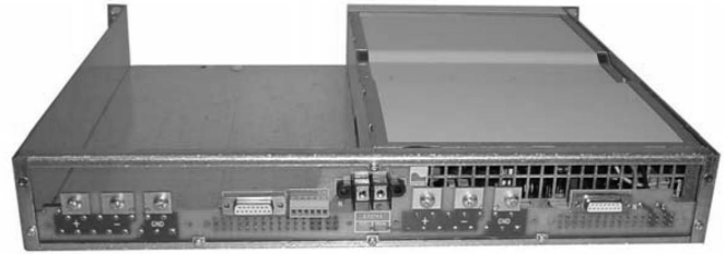
Rear panel ZMTSR8170 power frame for 2 x inverter modules